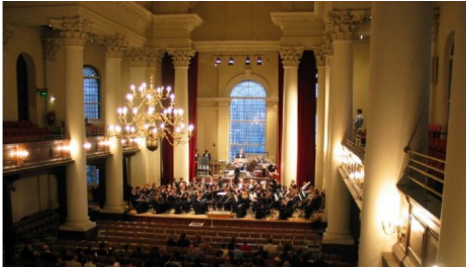
Performance at St. John's, Smith Square, London